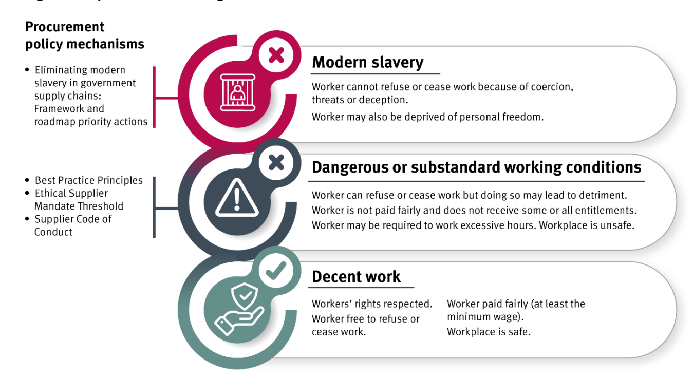
Diagram 2. Spectrum of working conditions