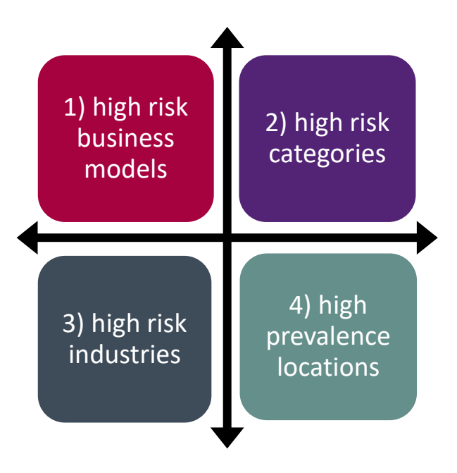
Diagram 3. Risk factors

The more high-risk factors present, the higher the risk of the supplier contributing to modern slavery either directly or indirectly. Australian Government resources and information to perform supply chain mapping and risk assessment are outlined in the Risk Assessment section of the guide.